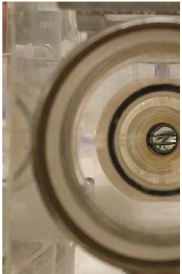
Mechanical valve (open), viewed through Multipurpose Port on the HDT-500