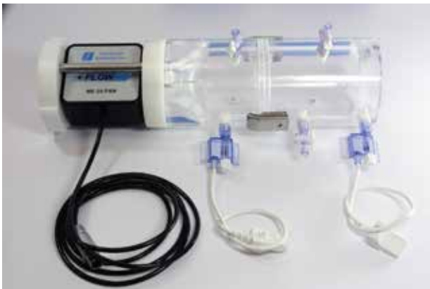
Sample test fixture with flow probe

Optimized Transonic System Ultrasonic Flow Meter with Probe gives precision volume flow measurement. The probe can accommodate up to four calibrations for various fluid types and temperature combinations.